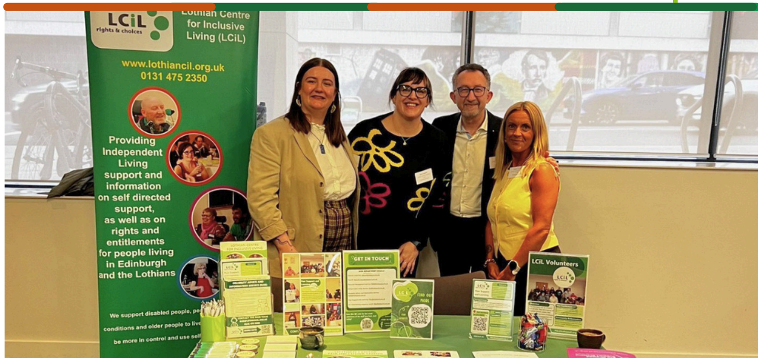
Image: LCiL team at SDS National Voice Conference