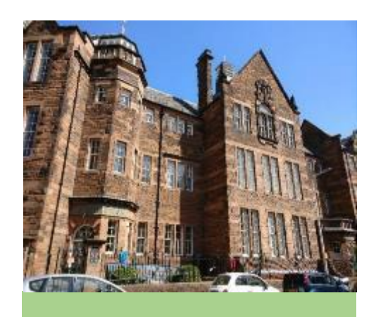
LCiL services are based out of our main office in Norton Park, Edinburgh.

We want to give a warm welcome to some new faces at LCiL: