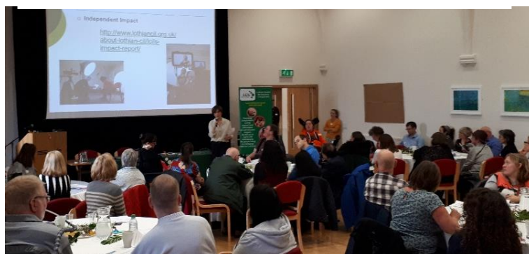
LCiL Impact Report Event 24/10/18